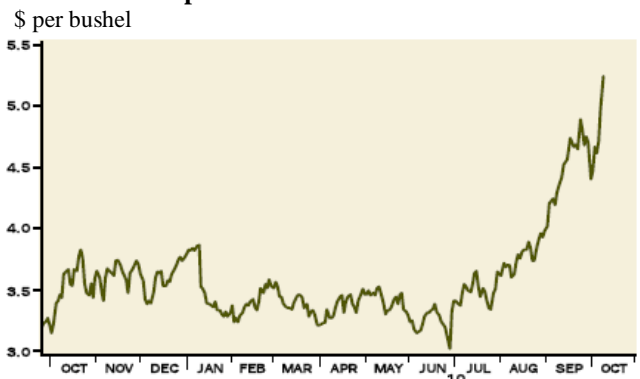
Chart 2: Corn prices

Having referred to the increase in commodity prices on the back of, inter alia, the weak dollar, without adding further comment, throughout this edition of Intermezzo we have plotted a few charts of selected commodities.